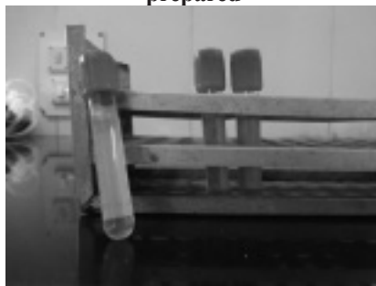
Figure 3 showing the final PRP prepared