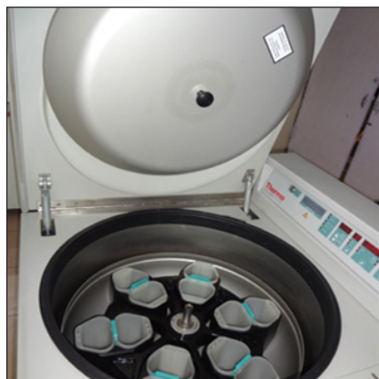
Figure 1 showing the centrifuge machine used