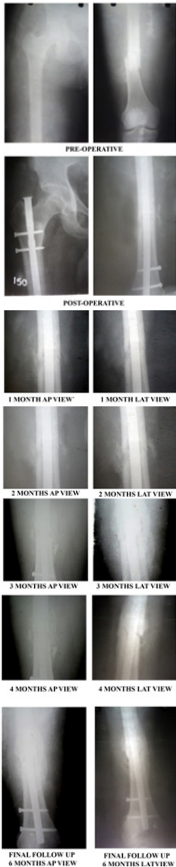
Figure 5 showing another index case